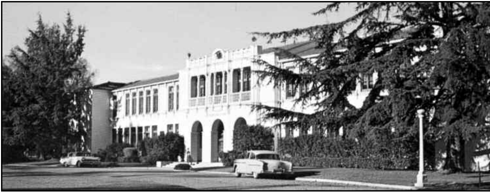
Tustin Union High School – Tustin, California, is of Spanish architecture. It is situated in the midst of the citrus area of Orange County. Photo from a postcard, circa 1950s.