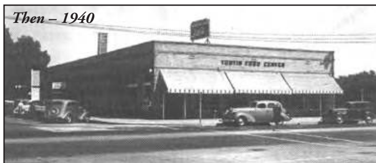
Then - 1940