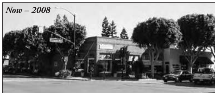
Now - 2008