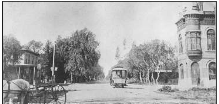
Downtown Tustin in early 1900's. This old trolley shown here is at the corner of Main Street and El Camino Real (then D Street). The old bank building pictured on the right corner.

Orange County Archives Phil Brigandi, Orange County Archivist Old County Courthouse, Room 101, Mon.-Fri. 9-12, 1-4:30, (714) 834-2536