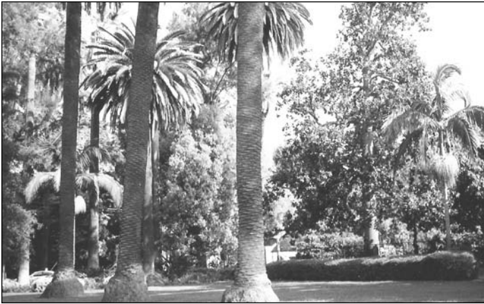
Tustin City of Trees - Join our Tree Walk as part of Tustin's Spring Promenade tour.