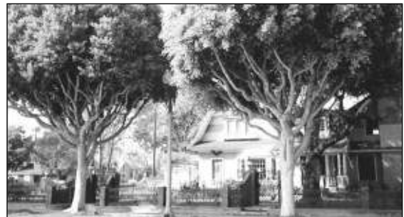
One of the lovely gardens featured on the Promenade Home & Garden Tour 'Springtime in Old Town'. 6 homes and 2 gardens will be shown on May 19th.