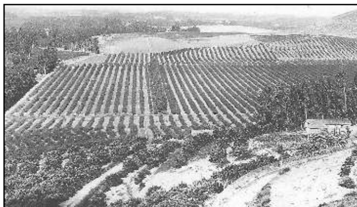
Lemon Heights of yesteryear.

Orange County Archives Phil Brigandi, Orange County Archivist Old County Courthouse, Room 101, Mon.-Fri. 9-12, 1-4:30, (714) 834-2536