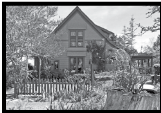
McCharles House Restaurant & Gardens