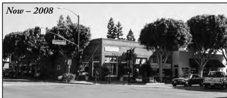
Now - 2008