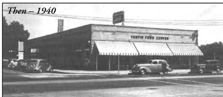
Then - 1940