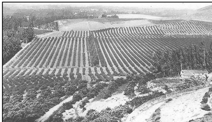
Lemon Heights of yesteryear.

Orange County Archives Phil Brigandi, Orange County Archivist Old County Courthouse, Room 101, Mon.-Fri. 9-12, 1-4:30, (714) 834-2536